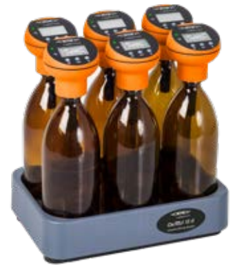
OxiTop®-IDS Set IS6

All measurements with the OxiTop®-IDS can be documented with a data acquisition program (download from www.wtw.com ) using the USB interface of the meter.