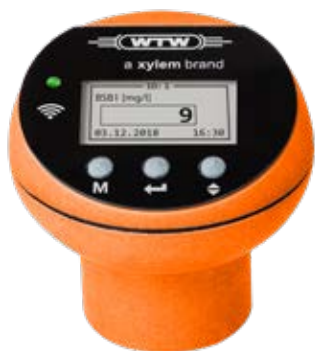
Oxitop®-IDS For all applications except biogas

The new OxiTop®-IDS is a modern measuring instrument for all kinds of respirometric studies. Regardless whether aerobic or anaerobic examinations, because of its versatility the OxiTop®-IDS is suited for both. All heads can be used independently from any meter for normal BOD measurements between one and seven days.