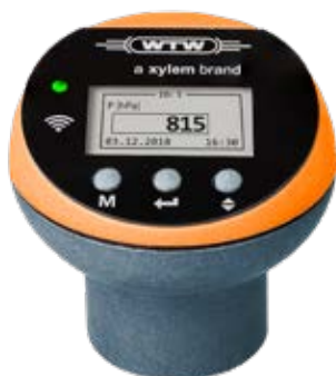
Oxitop®-IDS/B for all applications including biogas