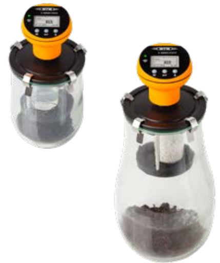
OxiTop®-IDS B6M 2.5 for AT4 tests